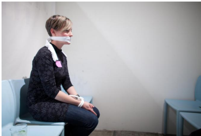
Figure 5. A spectator/performer in The Emancipated Spectator , by Yelena Gluzman.

The fourth One Act I will discuss is called (after Ranciere's text) The Emancipated Spectator (2010). It was commissioned by the British performance group Stoke Newington National Airport for one of their signature Live Art Speed