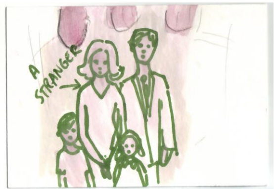
Figure 3. A planning sketch for Free Family Portraits , by Yelena Gluzman.

The third work in the series of One Acts is Free Family Portraits (2009). This piece was performed at an outdoor festival in Shibuya, Tokyo, at the invitation of the Japanese performance unit Potalive. In this piece, passing families are offered free family portraits. Posing for the photographer, the family is asked if a stranger can replace one of the family members. If the family agrees, one family member steps out, a stranger steps in (into a similar pose) and the ‘family portrait’ is taken. These photos are displayed at the site (with no indication that the families depicted are not authentic).