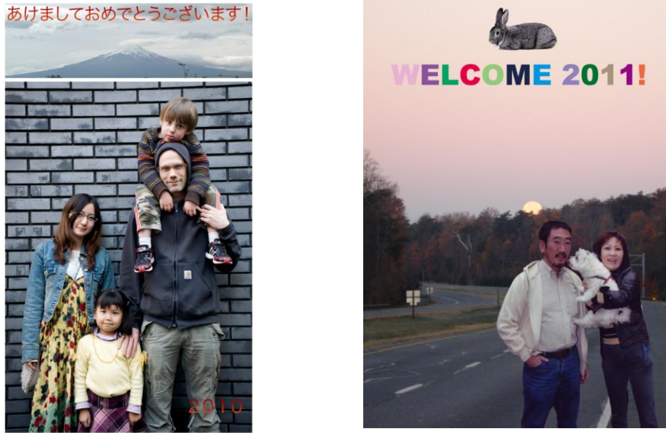
Figure 4. Images of 2010 and 2011 Free Family Portraits New Year greeting cards, each one picturing a free family photographed months earlier. Photos by Ayana Katayama and Koji Takaguchi, August 2009. Highway image (on 2011 card) by Dima Dubson.

of the performer/spectator. The requirement to perform is primarily an act of consent.