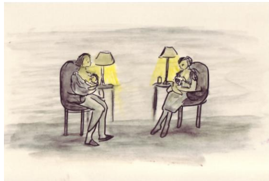
Figure 2. A planning sketch of M.E.A.T. , by Yelena Gluzman.

Figure 2 shows a sketch of the second work in the series, titled M.E.A.T. ( More Experiments in Art and Technology ). Here the notion of technology is invoked as